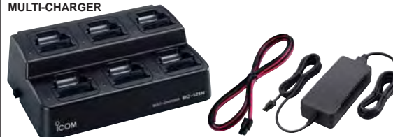
▲ BC-121N+AD-106 (6 pcs.)